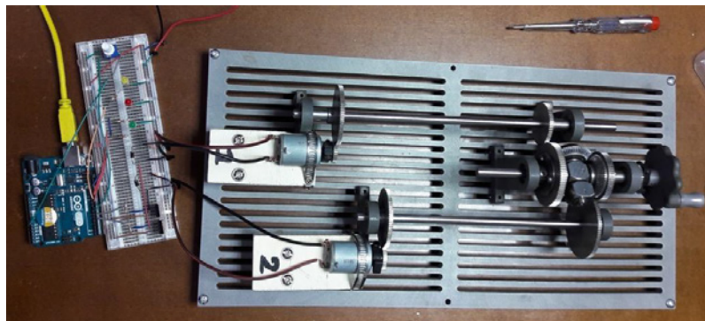
Figure 2. An example of a project developed by students (credits: Giorgio Parisi, Matteo Passafiume).