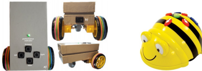
Fig. 2. Left: Robo-1 model: a) top view includes the control buttons and performance indicator; b) back view with the switch on-off button; c) general view of the robot; Right: Bee-Bot robot.

An example we introduce here is represented by Robo-1 with functionalities similar to market product, Bee-bot (Fig.2).